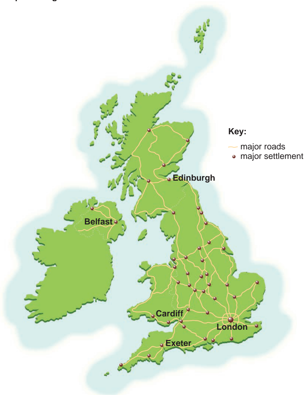
Fig. 2b Map showing the location of Exeter

Science park, including research into new supercomputer Commercial property at a business park John Lewis opens England's most south-westerly department store